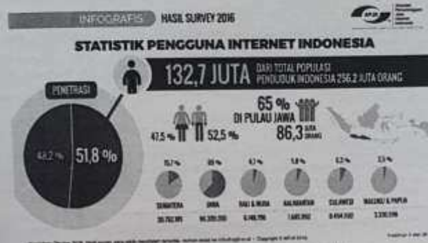
Figure 1. Indonesian Internet User Statistics

entertainment purposes. The most visited commercial content is online store, personal business and for social media are facebook, instagram and youtube. Below are the statistics of internet users in Indonesia based on APJII survey results in 2016.