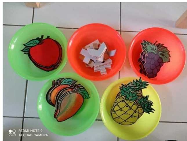
Figure 3. Papi Opung Media