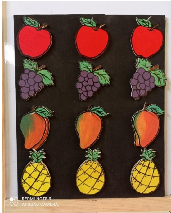
Figure 2. Papi Opung Media

more interactive; (3) helps to visualize material which is difficult to explain verbally; (4) increase children's motivation and excitement during the learning process so that learning objectives can be achieved optimally; and (5) the media is easy to use and apply as needed. It is in line with the statement of Patria & Iriyanto (2014) that children's enthusiasm and interest in learning activities which are in accordance with children's abilities and interests can be raised through the use of learning media. In addition, Azhima et al. (2021) stated that the use of learning media makes it easier for children to understand the learning context; besides, makes children more interested in participating in the learning process.