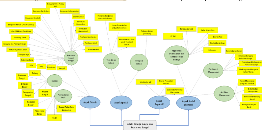
Fig. 1. Research concept chart

Research concept chart is presented in Fig. 1: