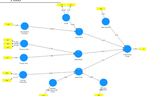
Fig. 3 Structural Model analysis of technical variables, spatial variables, social variables, regulation variables of the river performance index

The following is an image of the structural model developed in the analysis of technical variables, spatial variables, social variables, regulation variables of the river performance index.