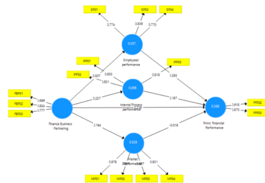
Fig 2. Model of Finance Business Partnering

The causality result of this study can also be shown in the following image: