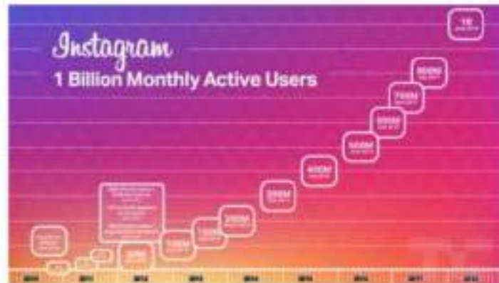
Figure 3. Instagram Active Users Source: Kompas.com, 2018

Marketing influencers are increasingly endemic in early 2018 along with the development of the era of social media, especially Instagram, where the digital platform has many users. Monthly Active User (MAU) Instagram breaks 1 billion users per June 2018, or grows by 5% from quarter to quarter (Kompas.com, 2018).