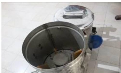
Figure 4. Construction Equipment Performance First peeler Onion

Materials for the manufacture of red onion peeler, which consists of dynamo, stainless plate, rubber peeler, klaker, pulleys, banbel, axles, and hoses. The main ingredient selected stainless with some consideration, namely: (1) because the working system of water-related tool, the selected materials that are not easily corroded steel; (2) material is safe and hygienic stainless steel; (3) do not give a bad influence on foodstuffs. The diameter of the onion peeler is the length 1000 mm, width 1000 mm and height of 500 mm. The diameter of the tool adapted to the capacity of the peeled onion is once processing as much as 5 kg, in addition to the design of the tool also pay attention to efficiency in the use, maintenance, and removal tools.