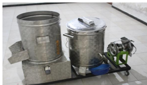
Figure 7. Automatic Processing Equipment Shallots (PEBMO)

PEBMO tool that has a working system that is paring its 3 red onions, red onion chopper, and oil drainer. The processing of onion using a manual system with a capacity of raw onion 5 kg require processing times of about 6 hours but if using a tool PEBMO processing of raw onion until it becomes a product fried onions high-quality packaging takes craftsmanship 45 minutes, so using Tools Pebmo can save processing time of about 5:05 hours craftsmanship so that the productivity by the use of a higher PEBMO tool.