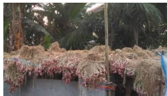
Figure 2. Preliminary Survey Results Shallots are Abundant Harvest.

Red onion becomes a commodity crops high level permintaanya good market for raw onion or shallot to refined, this is because the onion one herb that is always used in every Indonesian cuisines, so the demand for onion in Indonesia is very high either. However, despite the high market demand for red onion did not make the onion farmers prosper. This is because the price of onions in the market depends on the quality of onion sold. Onion