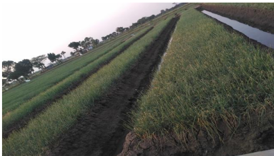
Figure 1. Preliminary Survey of Agricultural Condition Onion Fertile

Sekoto village is a village located in the district of Kediri. Sekoto village is very fertile village and has a vast agricultural land, most of the population lives from agriculture sector with major commodity crops are crops of onion. In the village of farmland Sekoto shallot has a high productivity as evidenced by Banon an area of 500, equivalent to 7000 square meters can produce 10 tons of red onion onion sebesar one harvest.