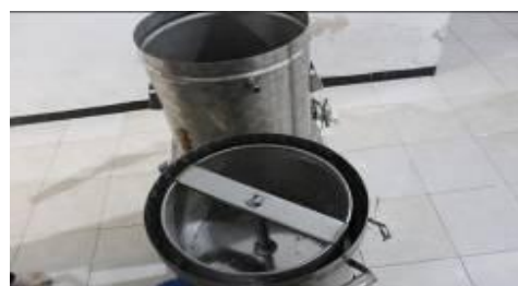
Figure 6. Construction Equipment Performance Third Oil Peniris

Oil drainer tool is designed with the goal of keeping the product fried onions become more healthy and durable. The materials used for the manufacture of oil drainer tool which consists of dynamo, sainlist plate, angle steel, banbel and stainlish sieve. Oil drainer tool diameter is 500 mm long, 500 mm wide and 500 mm high with a capacity of 2 kg of onions.