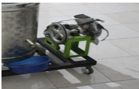
Figure 5. Construction Equipment Second-performance chopper Onion

Onion chopper tool made of angle iron, plate sainlist, cutting blades, magneto, capacitor, as. Use of the tool dynamo enabled in order to work automatically without using manpower, in addition to the use of dynamo makes the processing time becomes faster. Onion chopper tool uses two blades for cutting onions, it is intended that the results of the pieces of onion has a diameter of great thinness.