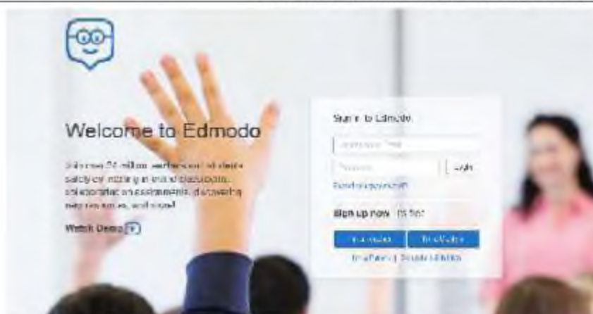
Picture2: The Login page and registration form of Edmodo

User interface for teacher and students is different; the different is on the administration box in the left side of the model it is also indicate that students and teacher has a different privilege to manage the site. Setting box for the teacher is use to manage the whole course handling by each of the teacher (See picture 3). Adding the course and manage the resources teacher just push the button in the administration site box. For adding a resources teacher need to put a drop down menu in the right side of the site.