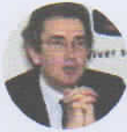
Franco Bernabè Member President, Telecom Italia