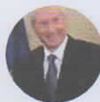
Thorbjorn Jagland Member Secretary General of the Council of Europe