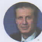
Bálint Magyar EIT Governing Board and Minister of Education