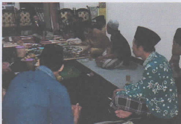
Fig. 2. Meeting with first partners

All of training participants, both the first partner as the training target and the second partner as companion partners were very enthusiastic and played an active role in each of the activities carried out. This can be seen from several contributions given by the participants during the activity, including: the first partner provides a place/ facility for discussion and theory activities, procuring sugarcane as material during training. The second partner with his willingness provides direction and guidance in making sugar from sugarcane. The two partners are also committed to continuing the collaboration and asking the dedication team to keep in touch by conducting supervision and providing assistance if needed.