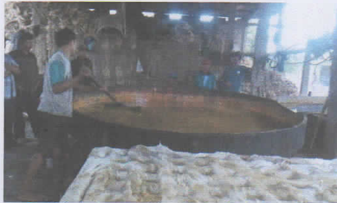
Fig. 5. Cooked sugarcane juice, stirred and ready for molding

Once the molding process is complete, immediately proceed with the next cooking process. One time the cooking process usually takes about 2 to 3 hours, depending on the size of the fire cooking stove. During the first cooking process, the first partner only sees while asking the second partner if something is not understood during the process. In the second