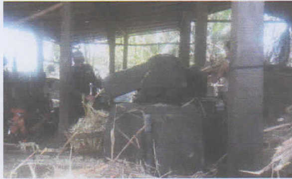
Fig. 3. Sugarcane milling process

also provides insight into the benefits that can be obtained if we process sugarcane itself compared to if we directly sell it to middlemen or to sugar mills.