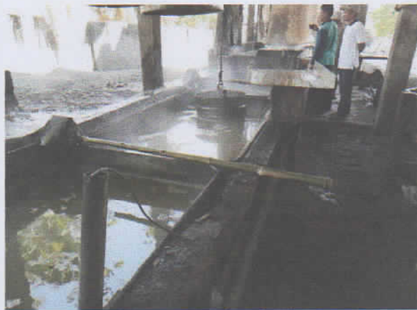
Fig. 4. Crater in 3 levels

In the next stage, the first partner was taken to the second partner's sugarcane mill in Cendono village, Kandat sub-district, Kediri district. In this place, the first partner can see and practice directly the process of making sugarcane with direction and guidance from the second partner who has experience in making sugar for more than 9 years. At the time of practice, the sugarcane material to be processed has a 9% yield value of 1 ankle truck or approximately 5 tons.