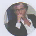
Bernard-Henri Lévy Member Intellectual, Philosopher and Journalist