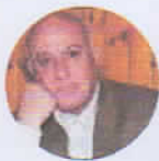
Ahmed Qurie (Abu Ala) Member Former Prime Minister of Palestine