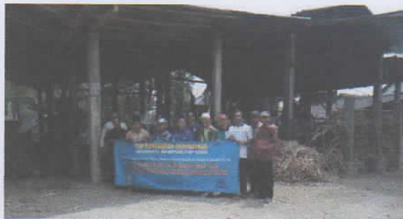
Fig. 1. The situation of sugarcane milling/ processing in the Cendono village

Meanwhile, in Kandat sub-district, many sugarcane farmers have processed their own sugarcane into sugar. Like in Cendono village, some sugarcane farmers have processed their sugarcane into sugar which is ready for consumption or ready for sale and is also ready to be processed again to be used as ingredients for making soy sauce, coconut sugar and ant sugar or used as one of the ingredients in the food/ beverage industry. But not all sugarcane is processed by themselves, they process the sugar themselves if the yield is high, it is usually above 8%, if the yield is below 8%, they sell it to the factory, because the operational costs are higher than the income. Sugar processing plant owned by sugarcane farmers in Cendono village, Kandat sub-district can be seen in Figure 1.