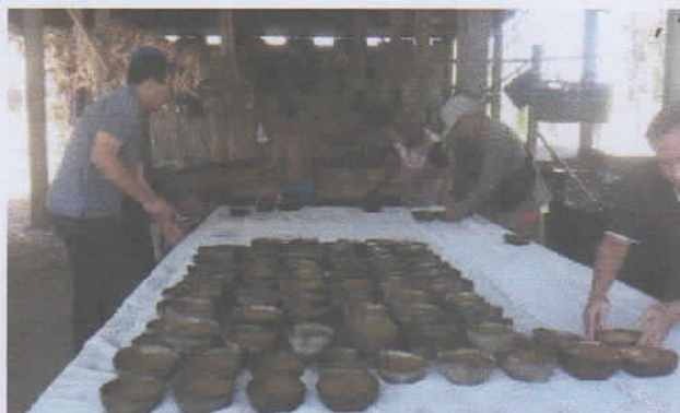
Fig. 6. Molding sugar

After completing the practice, an analysis of the benefits obtained from processing the sugarcane itself into sugar. Sugarcane ingredients weighing approximately 5 tons are cooked, producing brown sugar as much as 475 kg of sugar. During training, the price of sugarcane was 5,000, - / kg, so 5 tons of sugarcane cost 2.5 million. Brown sugar at the collectors' level at that time was 7,500 / kg, so 475 kg of sugar was 3,562 million. We get an increase in the selling value of sugarcane by 1.062 million, for 1 truck sugarcane with a capacity of approximately 5 tons, meaning that there is an increase in farmer's income of around 15% for every 5 tons of sugarcane. The operational costs of making sugar can be covered by the sale of compost obtained from waste from the processing of sugarcane. In addition to the increase in selling value, from processing the sugarcane itself, we can provide jobs for the surrounding residents.