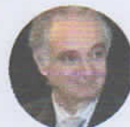
Jacques Attali Member President, PlaNet Finance