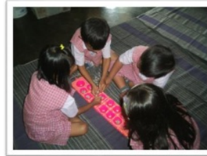
Picture 1. Children are playing 'congklak'

The 'congklak' game illustration performed in this study is illustrated in the documentation below: