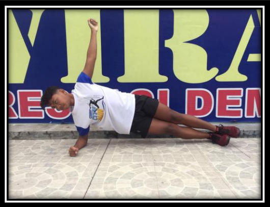
RIGHT SIDE PLANK