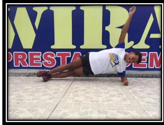
LEFT SIDE PLANK